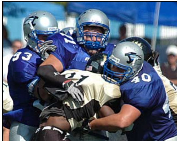
USF defense meets at ODU ball carrier in 2008

Kevin Donley Football Camps 9817 Blue Mountain Dr. Fort Wayne, IN 46804 Phone: 260-399-7700 ext. 6205